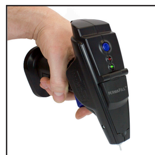
Aim and fill