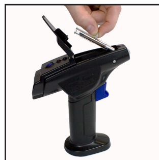
Insert cartridge, Power on